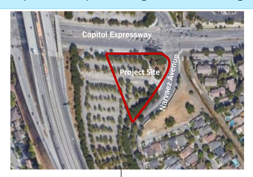
When: Wednesday September 14, 2022 6:00 PM