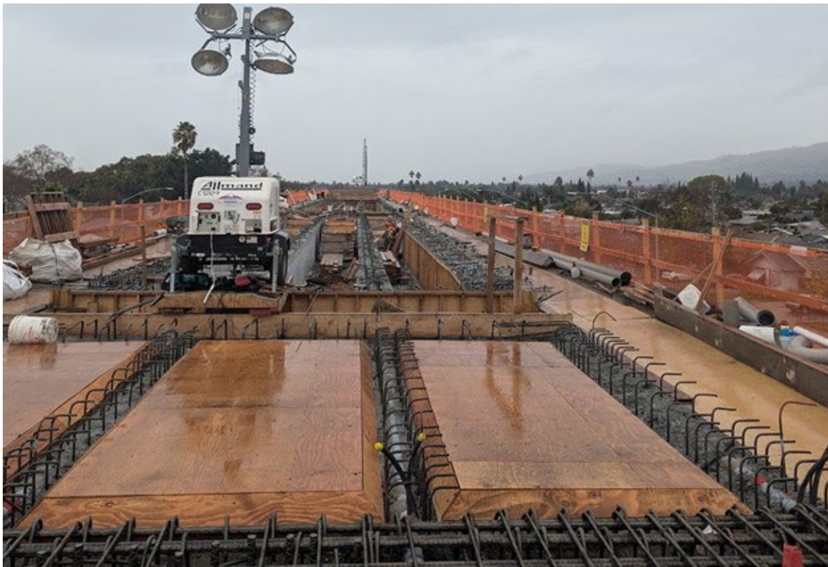
Top of bridge, preparing for concrete pour.