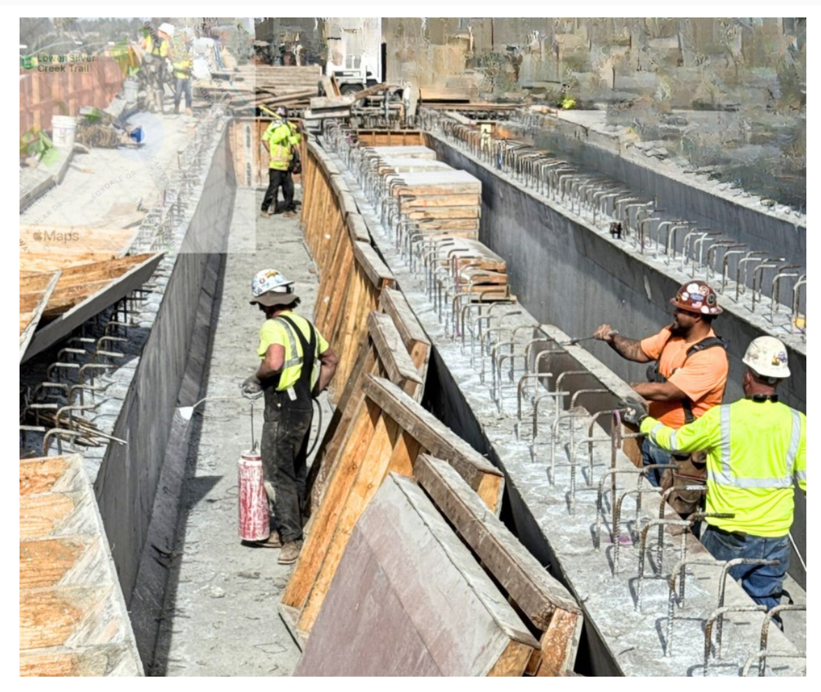
Construction workers remove the formwork from the bridge stem wall and apply curing compound.