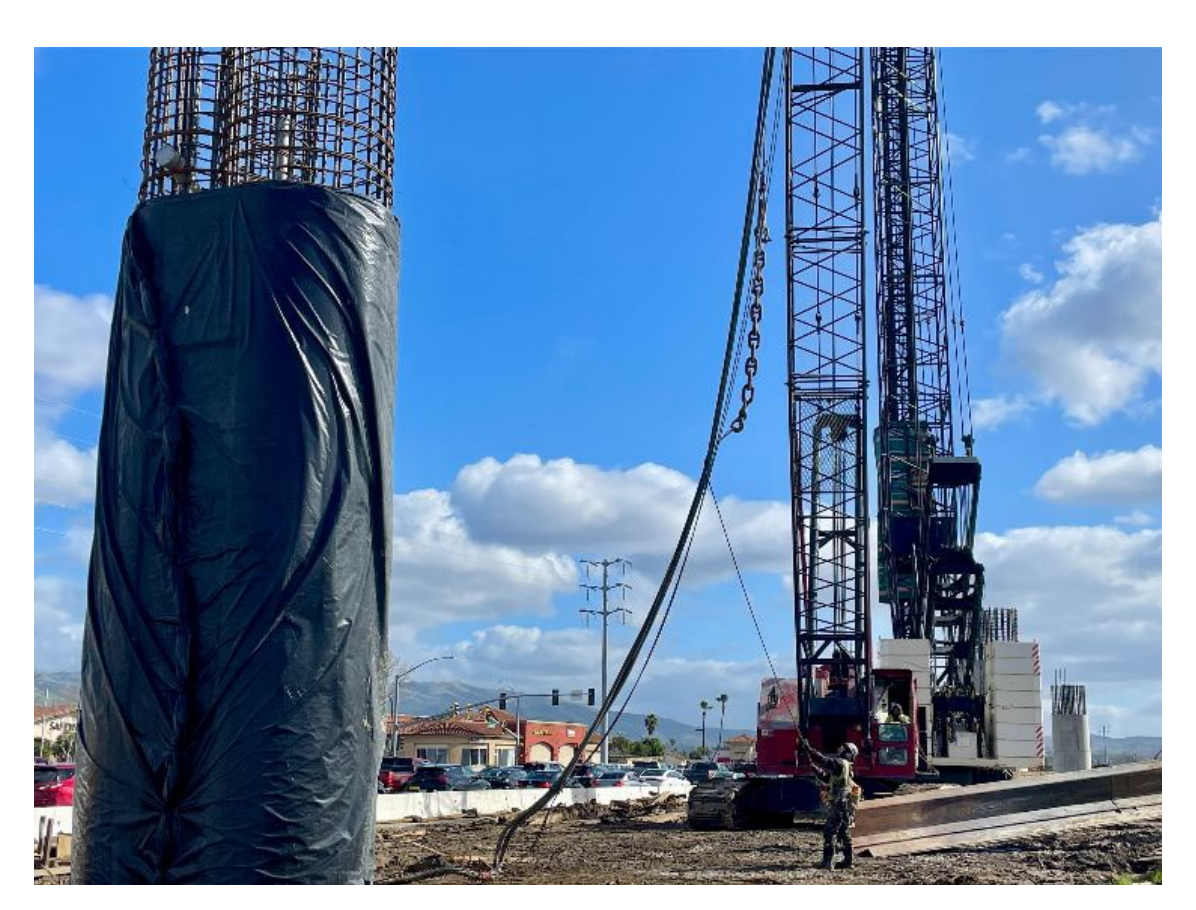
A worker in the field and a crane operator maneuver cables for sheet pile driving at the northwest corner of Capitol Expressway and Tully Road..

Anticipated work through Sunday, March 9, 2025 PARTIAL LIST