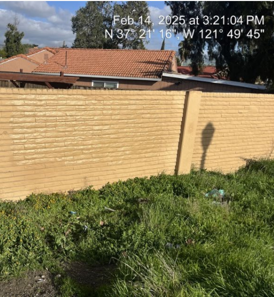
On Friday afternoon, one of the community members called to report graffiti. As usual, the team responded quickly and repainted the wall.

The Community Outreach Office has a new schedule: Tuesdays from 1:00 p.m. to 5:00 p.m. and by appointment. Staff is available weeklong to respond to the concerns of residents, business owners, and the community at large.