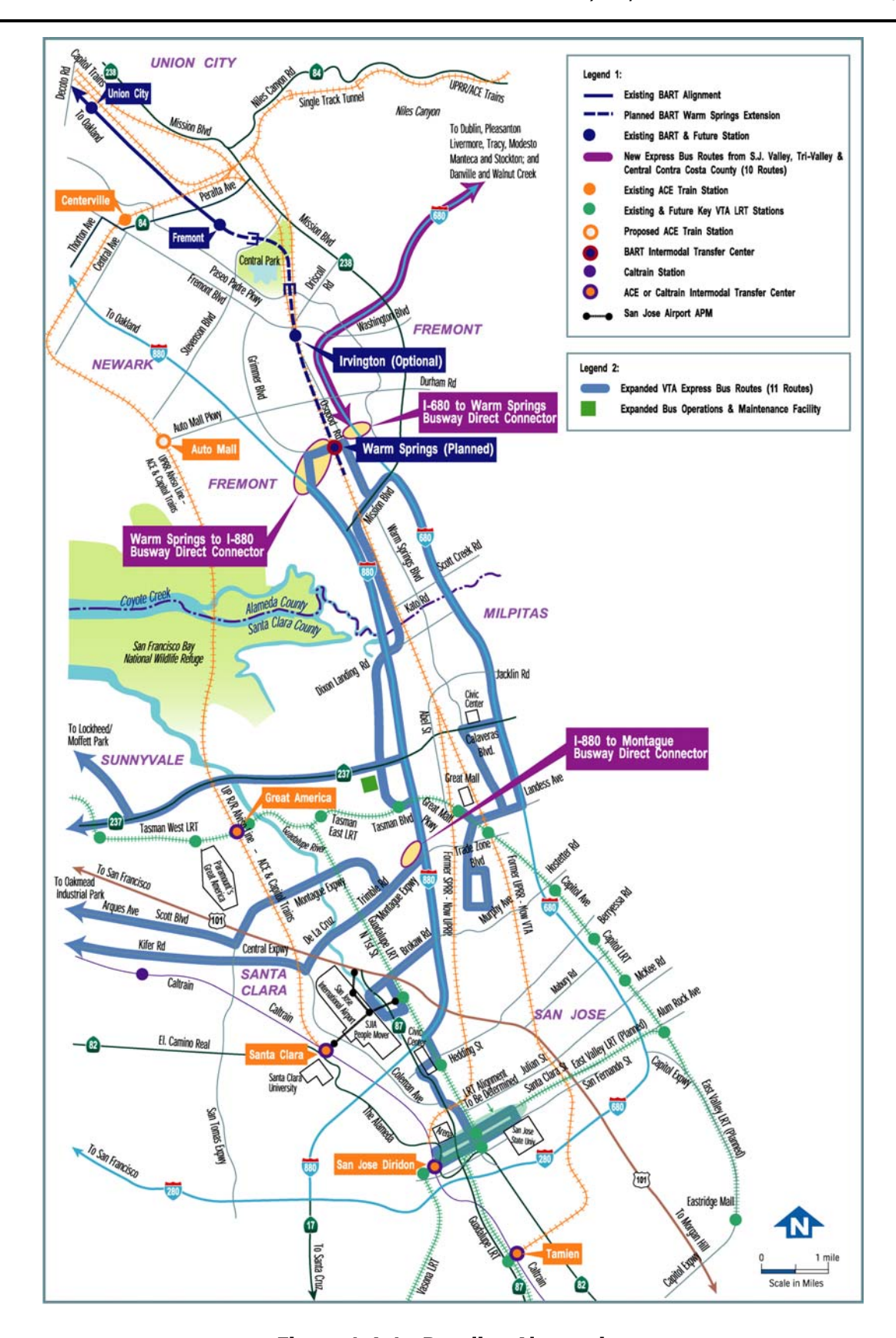
Figure 1.4-1: Baseline Alternative