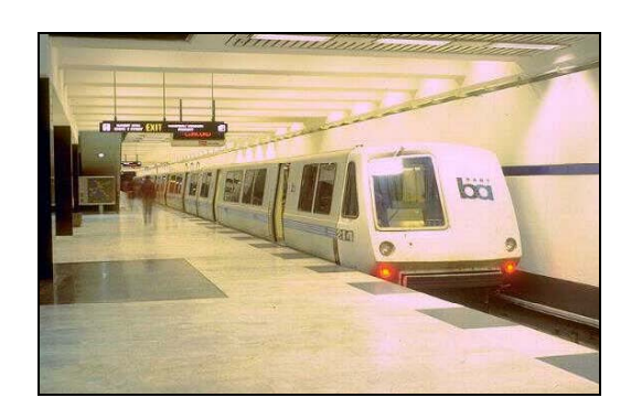
Figure 1.4-2: BART Subway Station

The BART Extension Alternative (BART Alternative) consists of a BART rail transit line constructed on the Union Pacific Railroad (UPRR) San Jose Branch right-of-way (ROW), now owned by VTA. The new extension would run between the planned BART Warm Springs Station and Santa Clara Street in San Jose, continuing in a subway (Figure 1.4-2) under public and private property through east and downtown San Jose, terminating at grade near the Santa Clara Caltrain Station (Figure 1.4-3). Service for the BART Alternative could start in 2013, if funding were available.