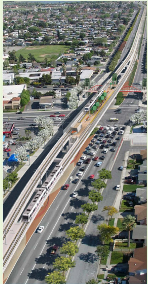
Proposed Story Light Rail Station